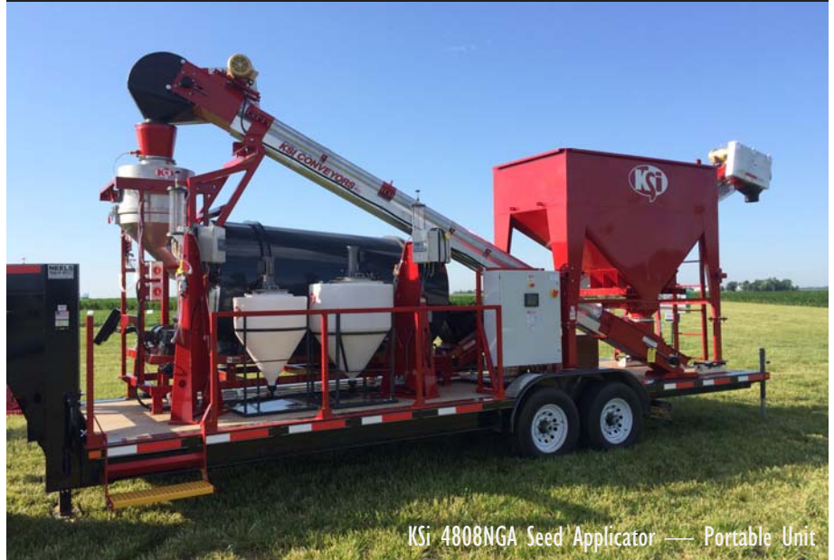
KSi 4808NGA Seed Applicator — Portable Unit

The KSi 4808NGA Seed Applicator — featuring advanced and accurate seed treatment equipment technology — is now available in a portable unit.