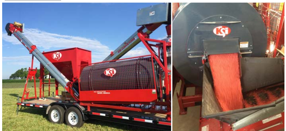
Standard 8’ Drum and DOT-Trailer for Flexibility